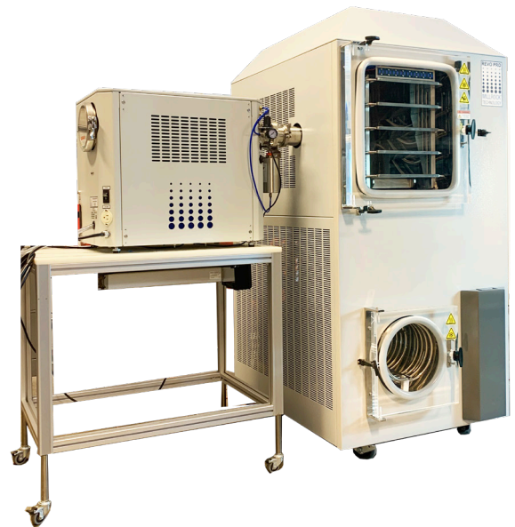
FreezeBooster NS20 (portable) attached to a REVO® Pro Lab

The Millrock FreezeBooster is a stand-alone module that can be attached to almost any laboratory freeze dryer. It does not require that the dryer have ASME rated chambers for high pressure and works within the parameters that the normal laboratory lyophilizer is designed for.